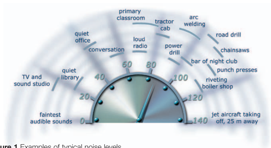
Figure 1 Examples of typical noise levels

Some examples of typical noise levels are shown in Figure 1. This shows that a quiet office may range from 40-50 dB, while a road drill can produce 100-110 dB.